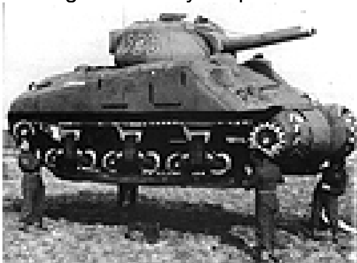
An Inflatable "Tank" from Operation Fortitude

(Compare Nathan Rothschild's—probably apocryphal—pretense of having received early news of a British defeat at Waterloo, so that he could profit by buying British government securities at temporarily depressed prices)